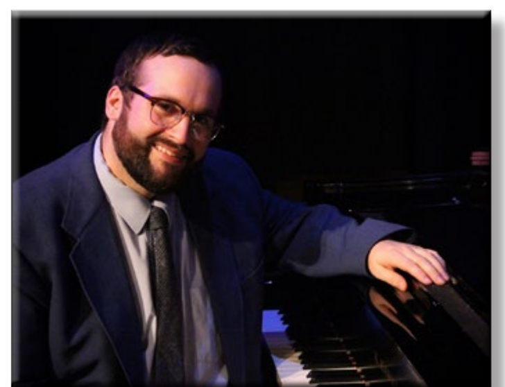
FN JANUARY, FEBRUARY, MARCH 2021